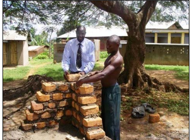
Villagers supply labour and building materials for the water and sanitation projects

Most of the school projects involve installing an under ground (UG) tank at the hand pump and siphoning off about 20% of the hand pumped water into the UG tank. This is then pumped to the school reservoir tank using one of the roundabout pumps. The tanks are made from local bricks which the villagers supply as their contribution to the scheme. They are also responsible for any manual labour such as digging trenches. As a result, communities enhance their ownership of the water and sanitation activities through active participation in the project.