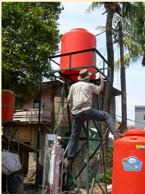
SkyHydrant installation in Cawang