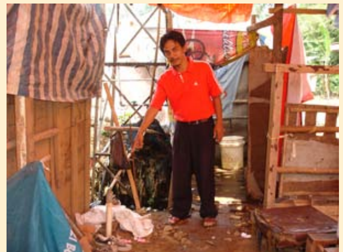
Head of the local people shown the place for the infrastructure