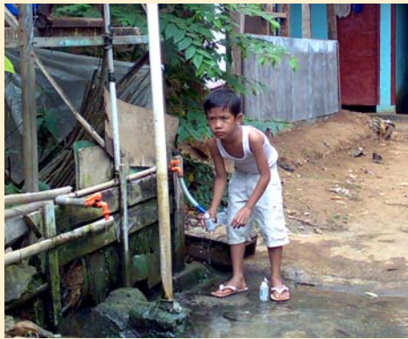
before, there is no clean water in this location

location was chosen because it is fulfil the SkyJuice requirements such as required a space 3 metres x 3 metres for the tanks and tanks stand, no water saline, ideal for schools, health clinics, hospitals and community water supply.