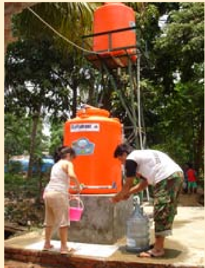
Clean water is very needed in this Cawang community

SkyJuice Foundation is not for profit registered charitable organisation which assist, provide, consult and supply potable water solutions to developing communities, countries and donor organisations. Since January 2005, they had supplied over 300 water filtration units, including East Timor, India, Indonesia, Kenya, Nepal, Oman, Sri Lanka, Pakistan and Thailand. In Indonesia, they had donated in Aceh after tsunami in 2004. They would donate Gunung Kidul, Wonosari, Sleman, and Klaten.