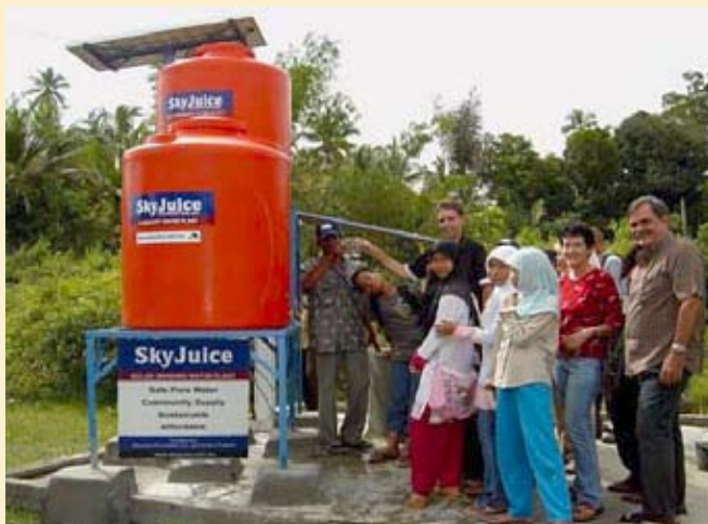
The Solar SkyStation unit in tsunami affected region of Indonesia provides clean drinking water to a school and local community from a polluted water well. This solar powered unit can produce over 10,000 litres of low cost clean water drinking water per day.

SDI had made some survey in many ares of Jakarta to find the location before decided to installed the machine in Jalan Arus, Cawang, Kramat Jati, East Jakarta. This